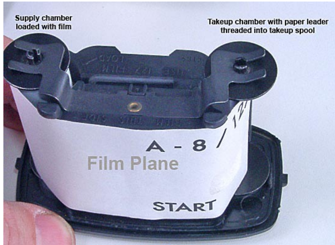
This illustrates how the film feeds from the supply chamber (on the left in this camera), across the film plane, and onto the take-up spool. The word "start" tells you that you are at the beginning of the roll.